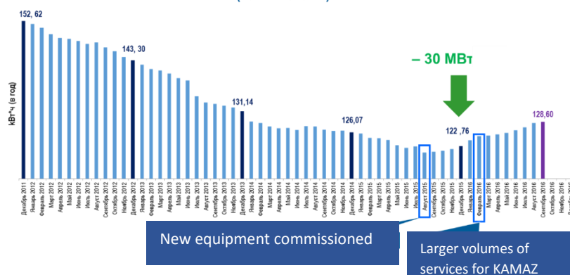
Annual electricity consumption dynamics (2011 – 2015 r.r.)